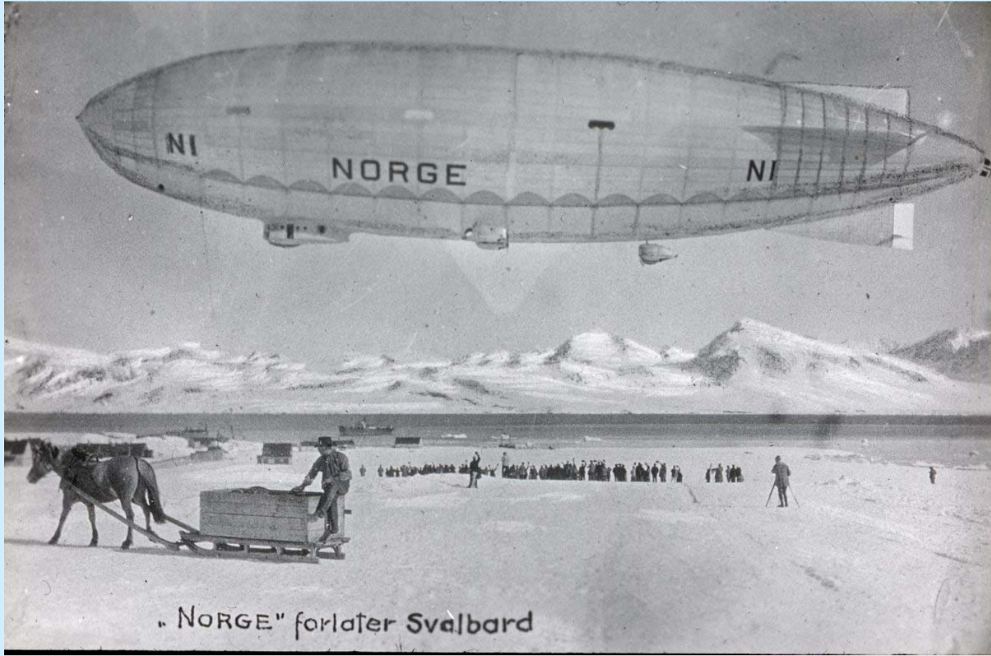
„NORGE“ forlater Svalbard